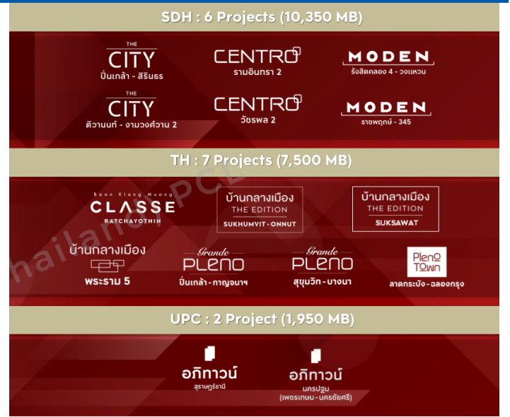
Figure 2: Aggressive project launches to continue in 3Q23 with new low-rise projects