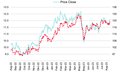
AP Thailand PCL (AP TB)