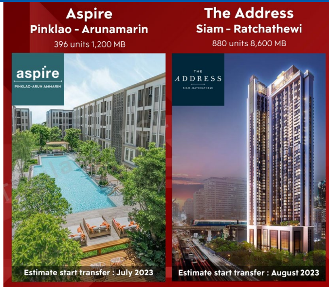
Figure 1: Two condominium projects to be key revenue contributors from 3Q23 onwards